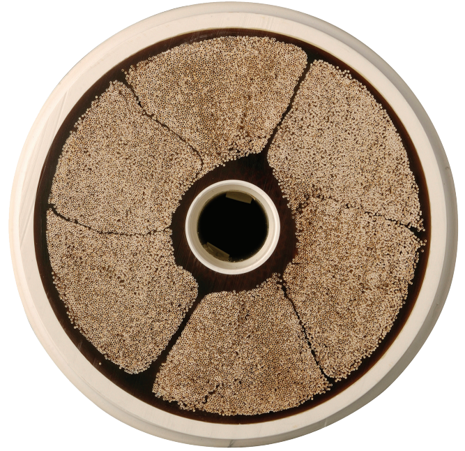
HOLLOW FIBRE MEMBRANE ELEMENT

With water injection systems installed across the globe, Eta has extensive reference lists available upon request.