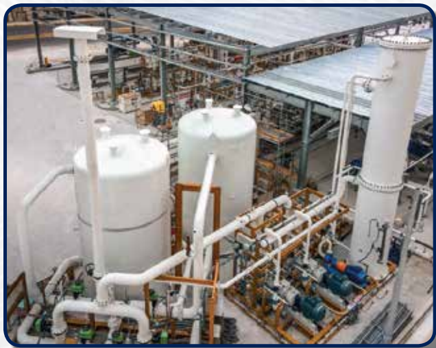
ZEECO® Vapor Recovery Unit

Zeeco's vapor recovery systems also meet the strictest emission compliance requirements around the world. From the lowest flow rates found in single truck-loading applications to the largest ship-loading operations, Zeeco designs vapor recovery systems that control emissions from 35 mg/L down to 1 mg/L.