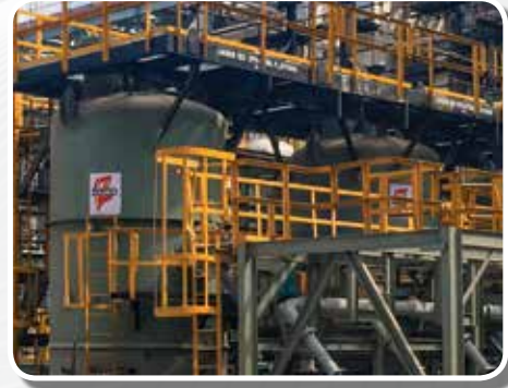
Vapor Recovery Unit

Let Zeeco help you operate smarter. Give us a call today and let's start talking about the right vapor recovery solution for your terminal.