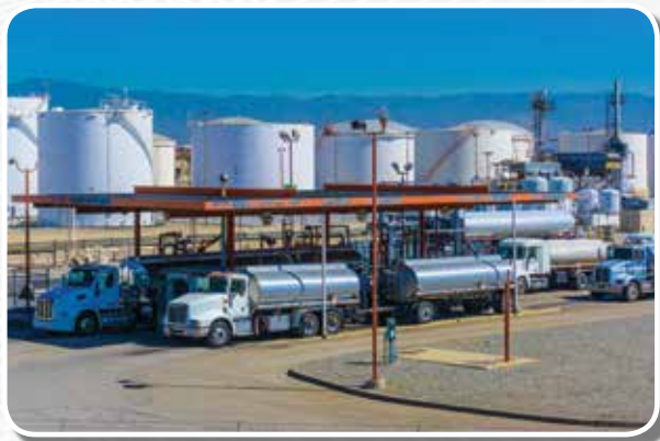
Truck Loading Terminal

Zeeco's Vapor Recovery Systems minimize emissions from the loading of trucks, ships, barges, and tanks, and return these valuable vapors to the loading or storage operation. Vapor recovery systems significantly reduce the loss of profitable products with recovery efficiencies up to 99%-plus and recovery rates between 1 to 2 liters per 1,000 liters loaded. In many applications, return on investment can occur within a few short years.