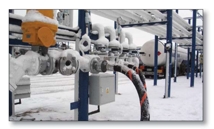
The TODO® SAFETY BREAK AWAY coupling are designed to eliminate spillage and damage associated with drive / pull away incidents. Offer exceptionally high flow capacity for their size.