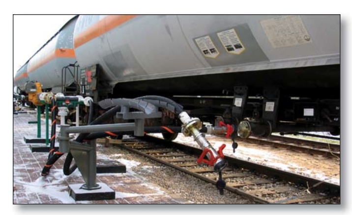
TODO-GAS® DRY-BREAK® couplings are designed specially for the safe an efficient handling of LPG in both liquid and vapour phases. Certified towards European Directive 97/23/EC (P.E.D.) category II.