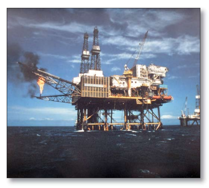
Major offshore exploration, chemical, pharmaceutical and petrochemical companies rely on TODO-MATIC® couplings to safely transfer their most aggressive and valuable liquids.

TODO-MATIC® DRY-BREAK® couplings provide easy, quick, safe and environmentally friendly handling of liquids and gasses. They minimise risk of operator exposure to emissions, provide better ergonomics, reduce human error and achieve commercial benefits through time saving / clean up costs.